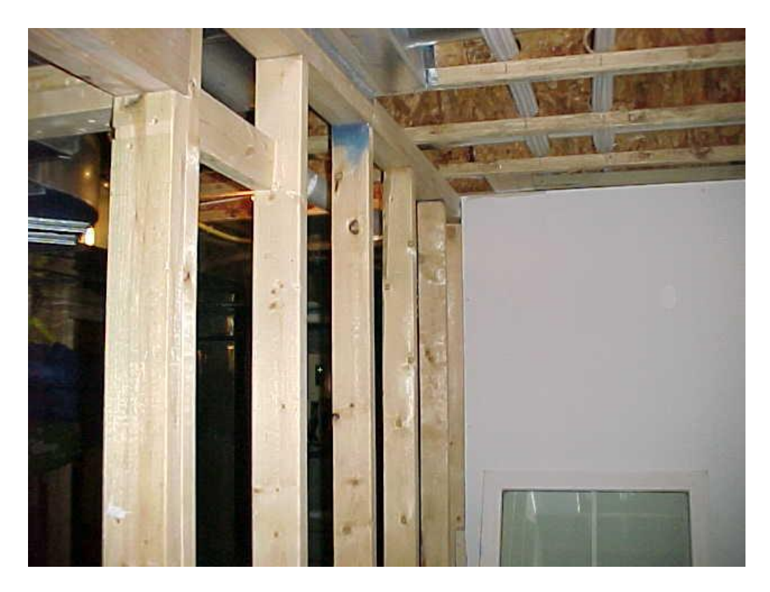
Figure 2. Load-bearing wall without sheathing used to support the I-joist framing.

To the untrained eye, the stud framing in Figure 2 is attractive and may not trigger any suspicion as causing tile and grout problems on the floor above. Apparently, in this