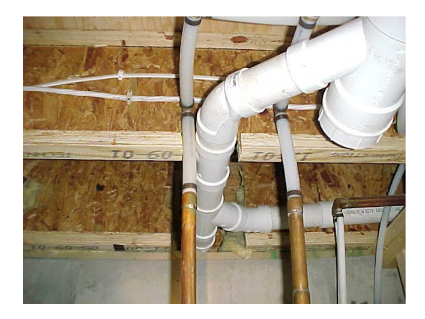
Figure 1. The I-joist depicted has no recognized load capacity because the bottom flange has been cut. The practice of cutting I-joist may stem from the fact that a 2x10, for example, may be notched per the code up to 1.54-inches (or D/6) in the outer thirds of the span (IRC, Figure R502.8). Since a typical depth of Ijoist flanges is 1-3/8 inches, using the maximum permitted "notching rule" for a solid-sawn 2x10 on an I-joist destroys the strength and stiffness capabilities of the joist.

It may be obvious that the cut bottom flanges are detrimental to the strength and stiffness of the joist shown in Figure 1, but the impact of the cut joist on the ability of subfloor sheathing to support a brittle floor surface may not be obvious or well understood. The cut joist, which is approximately 17" from the concrete wall, causes the effective spacing of the joists supporting the subfloor to be 32", well in excess of the 16" permitted joist spacing for method F144-07. Note that a second joist flange in Figure 1 is also cut. However, because it had a slight amount of bearing on a sill plate, we did not include in our analysis the possible impact of the cut flange on subfloor span.